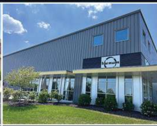
Grand Rapids, MI